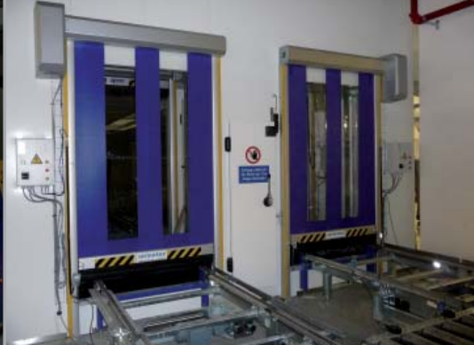
Cooling tunneltwo-lane version