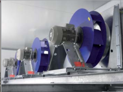
High-capacity fanspowerful and low-maintenance